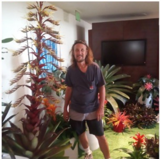
Sarasota Bromeliad Society Plant Display.