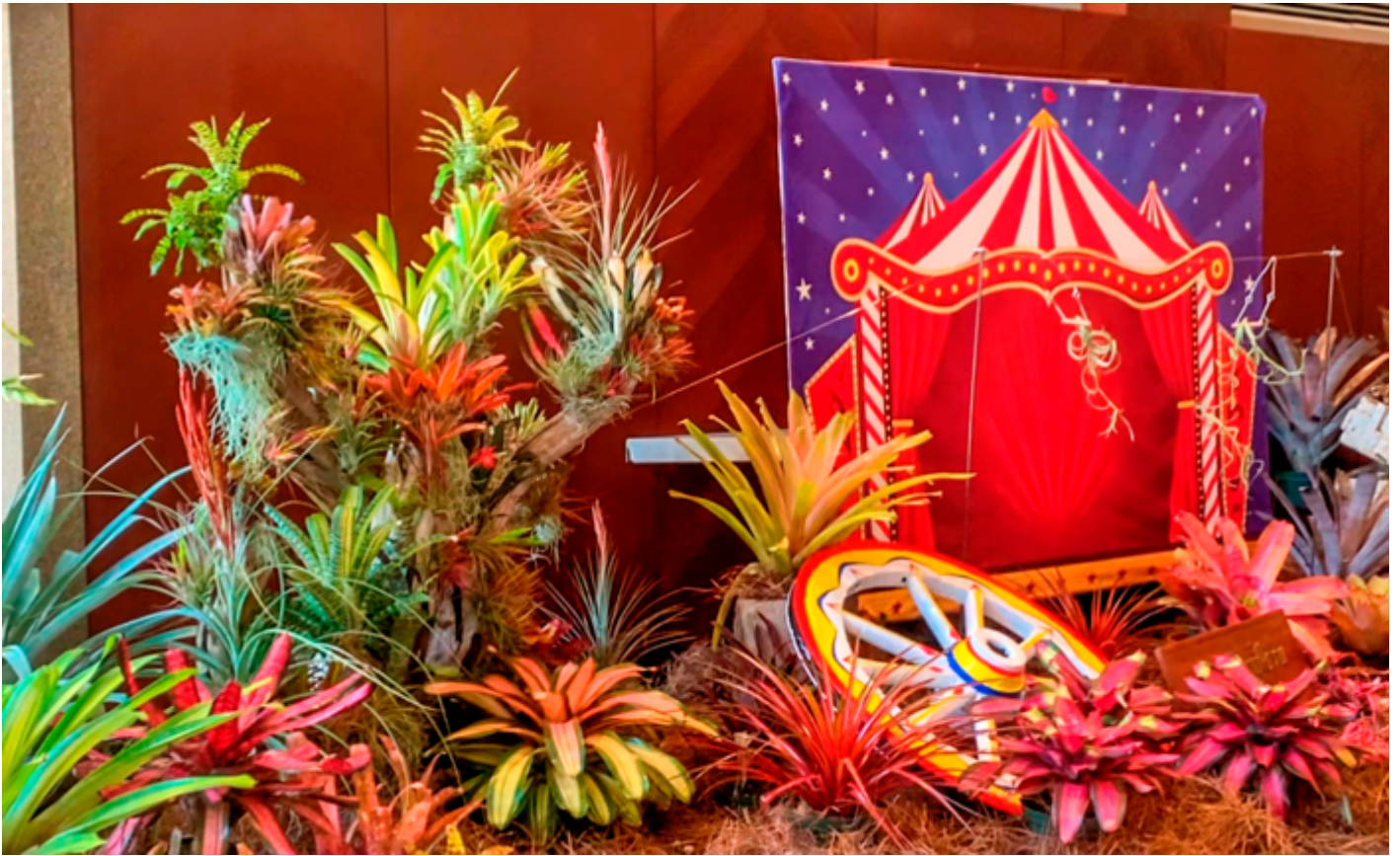
Tropiflora Nursery Plant Display.